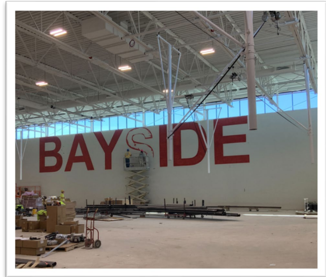
Gym lettering is being installed.