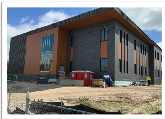
Exterior façade detailing outside of the classrooms.