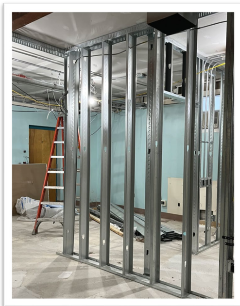
Demolition in the locker room for new plumbing rough-ins.