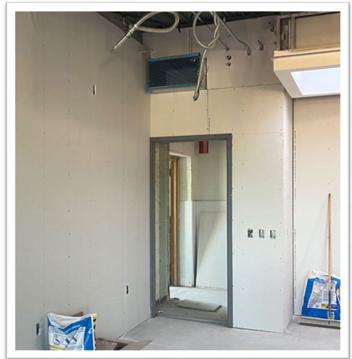
Drywall is nearing completion in the conference rooms.