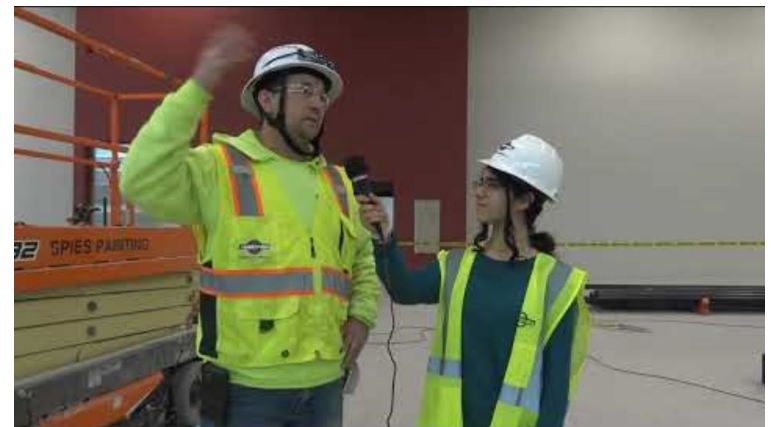
Bayside News Construction Update.